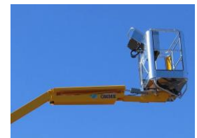
Fly jib (option)