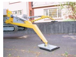
Easy set up